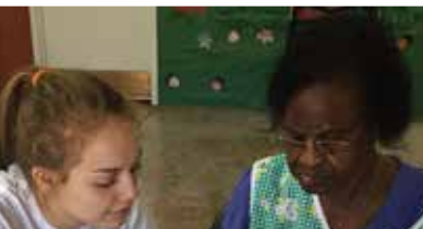
Seniors from Ravenwood H.S. volunteering at our Adult Day Program.