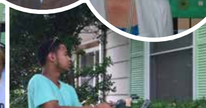
A volunteer from Rolling Hills Community Church trimming the hedges at a home in our residential program.