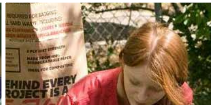
A volunteer from Cross Point Community Church serving at a home in our residential program.