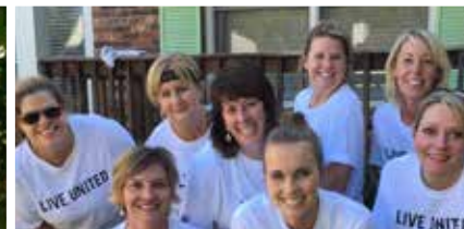
Friends from Southern Land providing some much needed TLC at some of our homes through United Way of Williamson County's Day of Caring.